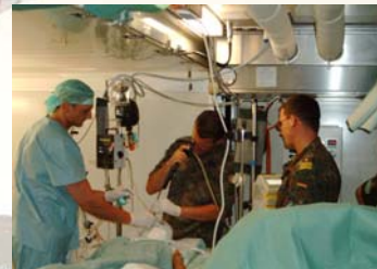
ICU - Kabul Field Hospital