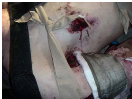
Penetrating lung trauma