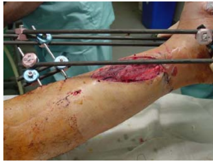
External fixation – Mine-trauma