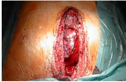
Penetrating abdominal trauma – Open surgical treatment