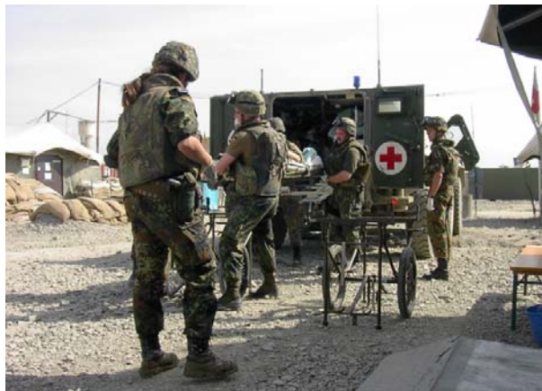
Wounded transported to the Kabul Field Hospital