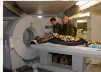
CT-scan - Kabul Field Hospital