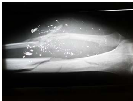
Penetrating extremity trauma