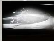
Penetrating extremity trauma – external fixation