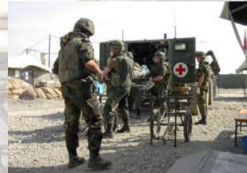
Wounded soldier transported to the Kabul Field Hospital