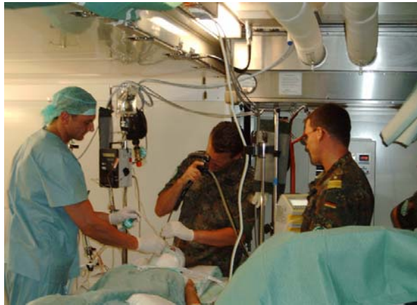
ICU - Kabul Field Hospital