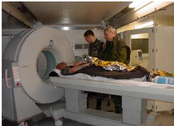
CT-scan - Kabul Field Hospital