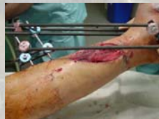
Mine injury, extremity trauma – external fixation