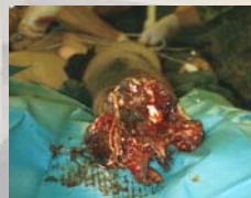
Mine Injurié – Open Resection