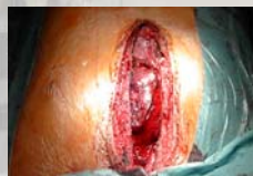
Penetrating abdominal trauma – Open surgical treatment

A principle of support given by the medical service. Surgical treatment should take place as soon as possible, but at last six hours after wounding. This principle directs the location of the first line surgical unit, which can provide life-saving and limb-saving surgical procedures. The unit must be reachable within 4 hours after wounding.