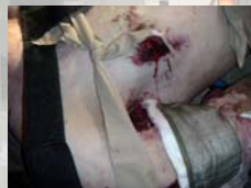
Penetrating lung trauma – lung resection